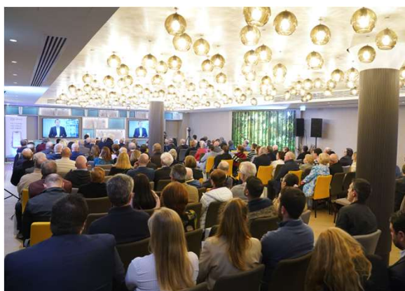
medirectalk with Liontrust