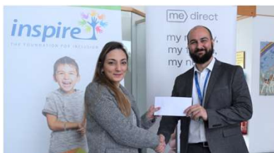
World Autism Day

The Group employs nationals from 31 different countries, and 38% of its employees are female - 15% serve in managerial positions whilst the remaining 23% serve in the officer level. MeDirect continues to operate through a hybrid working model, enabling its employees to work from home or from the office. MeDirect recognises that its employees are key to its success in implementing the Group's strategy.