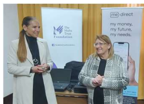
Malta Trust Foundation