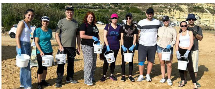
Beach clean up

MeDirect supports a range of charities and talented individuals through sponsorships, donations and the voluntary actions of its employees.